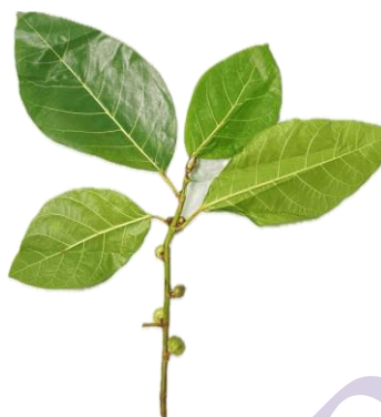
Figure 1. F. septica Burm.f. showing a branch with leaves and cauliflorous syconia (figs).