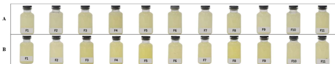
Figure 1. Organoleptic of red palm oil submicroemulsion from (A) magnetic stirrer, (B) homogeniser

The red palm oil submicroemulsions prepared using a magnetic stirrer or homogenizer exhibited organoleptic properties, as shown in Figure 1 and Table 2. As shown in Table 2, the organoleptic evaluation on day 0 showed that all 11 RPO submicroemulsion formulations, regardless of the stirring method (magnetic stirrer or homogenizer), maintained a liquid physical state and were visually homogeneous, with no observed phase separation. The intensity of color (scores 1-3) and odor (scores 2-4) generally correlated with the RPO concentration in each formula. In terms of appearance, although most formulations achieved a transparent state, some formulas processed with the high-speed homogenizer (particularly Formulas 3, 4, 5, and 8) showed an opaque appearance compared to the formulas processed with the magnetic stirrer. This variation suggests that the higher mechanical energy input from the homogenizer in this specific process may have triggered a different globule dispersion pattern and interfacial arrangement.